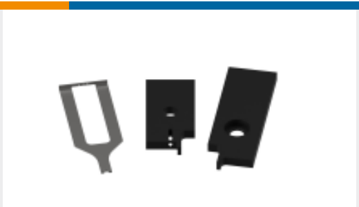
TE Part #2119791-5 Depressor, Wire