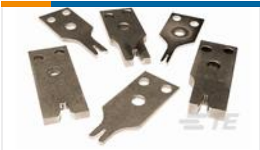
TE Part #456407-5 CRIMPER, WIRE .100 "F"