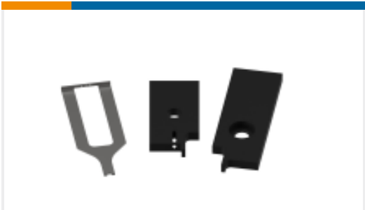
TE Part #2119757-8 DEPRESSOR, SHEAR