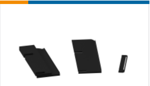
TE Part #1320928-2 STRIP GUIDE