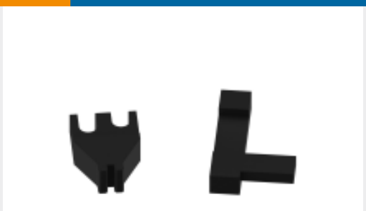
TE Part #1752356-3 SUPPORT, TERMINAL