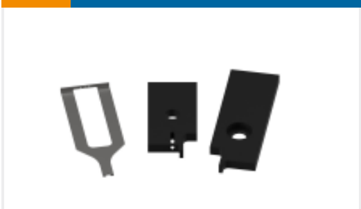
TE Part #2119757-4 DEPRESSOR, SHEAR

Datasheets & Catalog Pages CRIMPING WHERE FORM MEETS FUNCTION