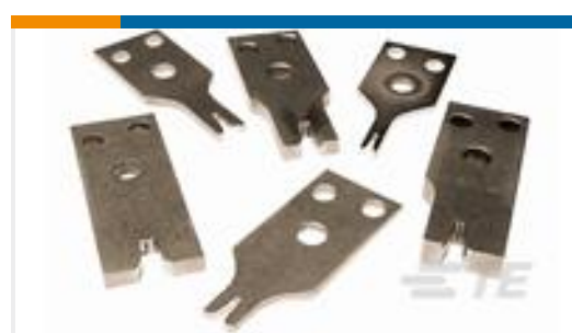
TE Part #1-456406-8 CRIMPER WIRE .090 F