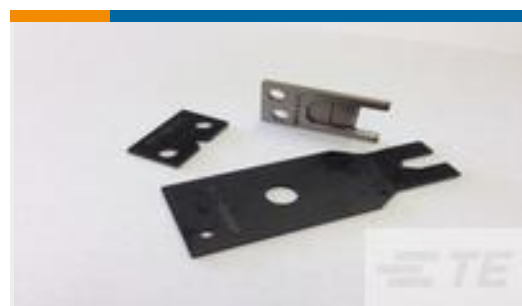
TE Part #1-690474-5 SHEAR BLADE