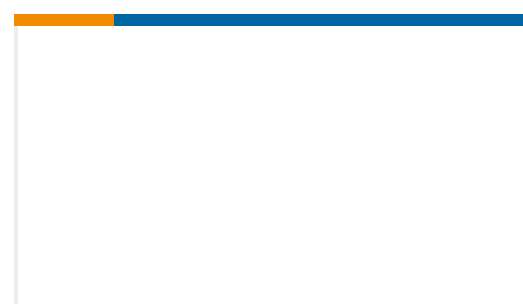
TE Part #853358-3 MACH U-POD 187 9SAPR090F140F G