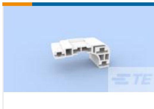
TE Part #1969116-1 187 & 250 FASTON HSG., REC., 3 POS, NATRUAL