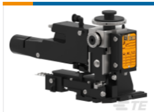
TE Part # 2836129-2 OCEAN_2.0_APPLICATOR-S-033F055O