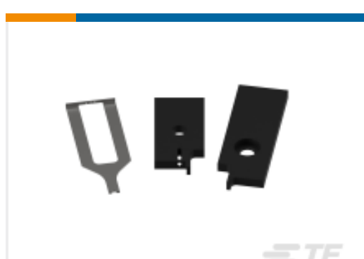
TE Part #1490525-1 DEPRESSOR, WIRE