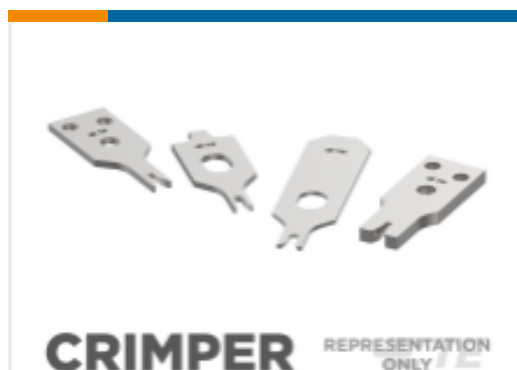
TE Part #1803224-9 CRIMPER, WIRE F