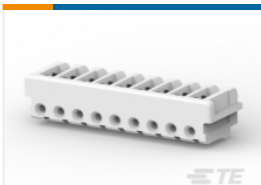
TE Part #179228-3 AMP COMMON TERMINATION HOUSINGS