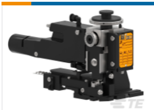
TE Part # 2836135-2 OCEAN_2.0_APPLICATOR-S-033F055OA