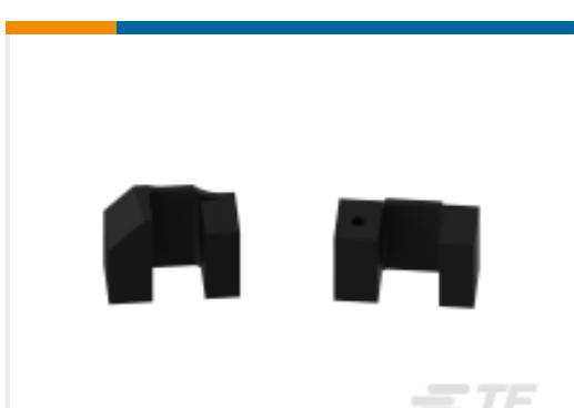
TE Part #1338684-1 SHEAR HOLDER, FRONT