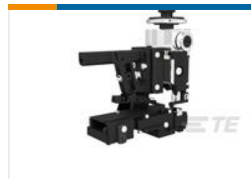
TE Part #2151011-1 OCEAN_2.0_Applicator-S-042F070F