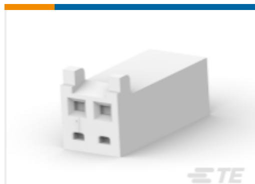
TE Part #1744318-1 Receptacle Housing: 2.54mm, 1 Row, CST-100 II