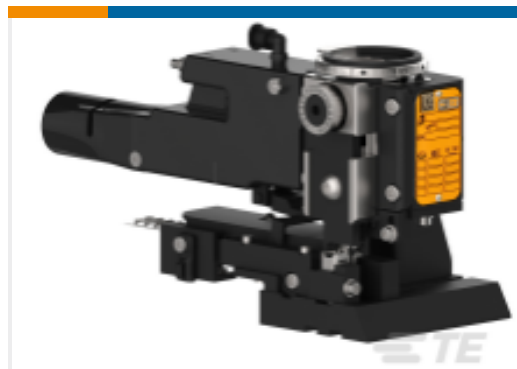
TE Part # 2-2836135-2 OCEAN_2.0_APPLICATOR-S-033F055OA