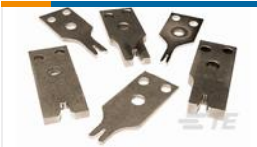
TE Part #1-456403-6 CRIMPER WIRE .062 F