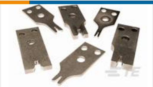
TE Part #2-1633730-4 CRIMPER, WIRE F .062 F