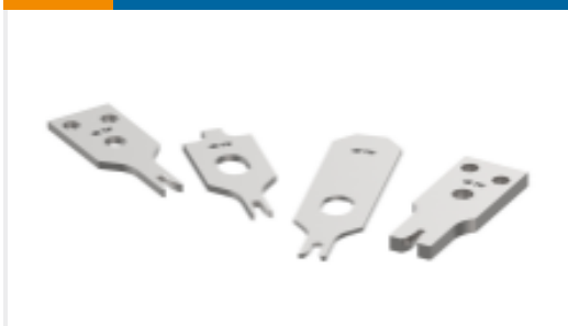
CRIMPER REPRESENTATION ONLY TE Part #1803364-3 CRIMPER, WIRE, F PREMIUM NON-TYPICAL RK