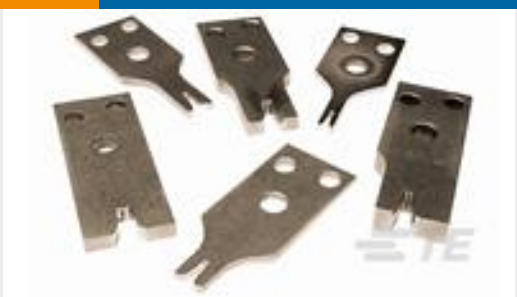
TE Part #1-456405-6 CRIMPER WIRE .080 F