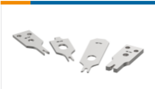
CRIMPER REPRESENTATION ONLY TE Part #7-456402-9 CRIMPER, WIRE .055 "F"

Datasheets & Catalog Pages CRIMPING WHERE FORM MEETS FUNCTION English