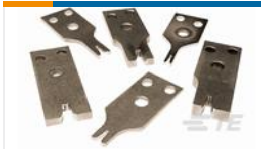
TE Part #1-456404-8 CRIMPER, WIRE .070 F