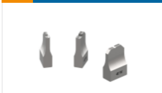
ANVIL REPRESENTATION ONLY TE Part #1803537-7 ANVIL, COMBINATION