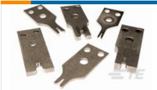
TE Part #2-456134-2 CRIMPER, INSULATION "F"(.110")