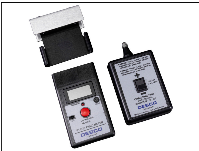
Figure 2. Desco 19443 Air Ionization Test Kit