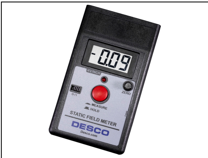
Figure 1. Desco 19442 Digital Static Field Meter