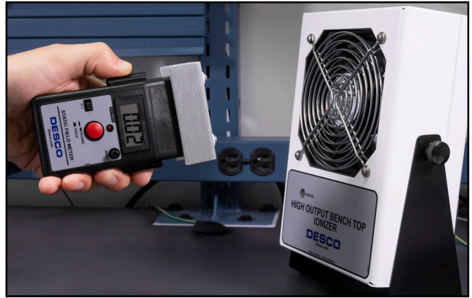
Figure 9. Using the Digital Static Field Meter with Conductive Plate to measure the offset voltage of a benchtop ionizer

NOTE: When testing pulsed ionizer systems, the voltage displayed is constantly changing. This pulse rate may be faster than the display update rate of the Digital Static Field Meter, therefore the displayed voltage is an average of the actual voltage. The output of the Digital Static Field Meter is useful in this situation for more accurate measurements.