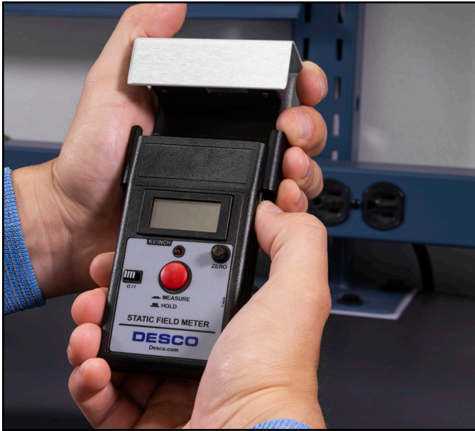
Figure 8. Sliding the Conductive Plate onto the Digital Static Field Meter