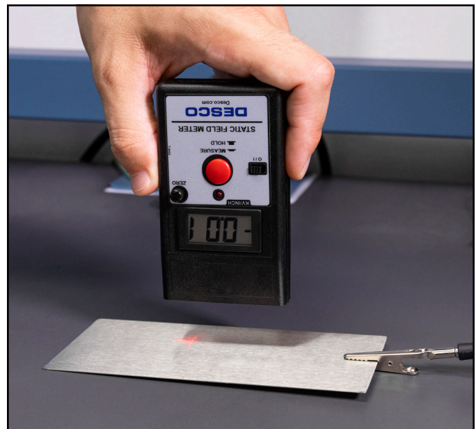
Figure 6. Pointing the Digital Static Field Meter to a grounded surface

Slide the power switch to the right to power the Digital Static Field Meter. Point the top of the Digital Static Field Meter approximately 1 inch (2.5 cm) away from a grounded metal surface. Proper spacing is indicated when the two red bullseyes emitted LED range indicator become centered on top of each other. Turn the rotary zero knob until the Digital Static Field Meter's display reads 0.00.