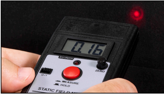
Figure 7. Aligning the two bullseyes emitted by the LED range indicator