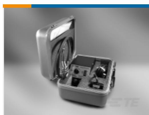
TE Part # 173643-000 RH-3960-1-TINEL-KIT-120V