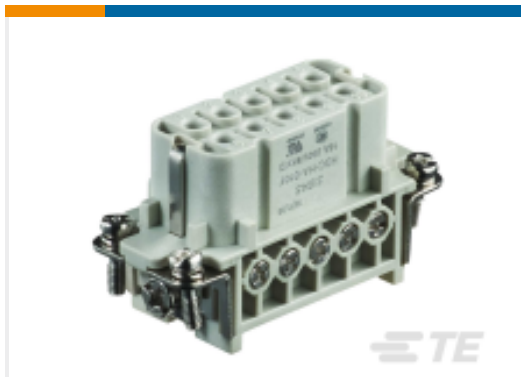
TE Part #T2010102201-002 HA-010-F