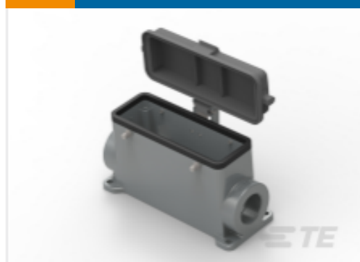
TE Part #T1490240232-000 H24B-SDRH-BO-2M32