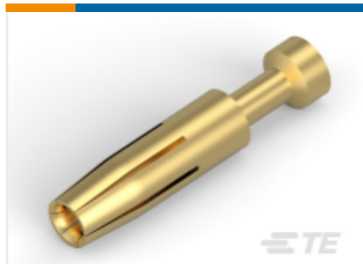
TE Part #T2030012005-000 DEF-0.5