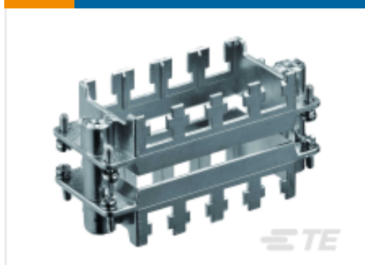
TE Part #T2070164001-000 H16BN-T4