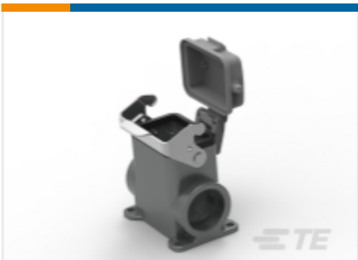
TE Part #T1660063232-000 H6B-SDRH-2M32