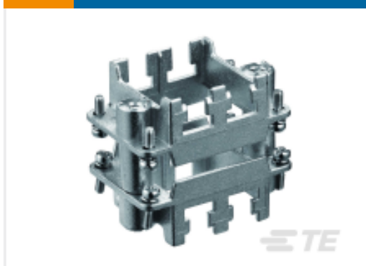
TE Part #T2070244101-000 H24BN-T6-M