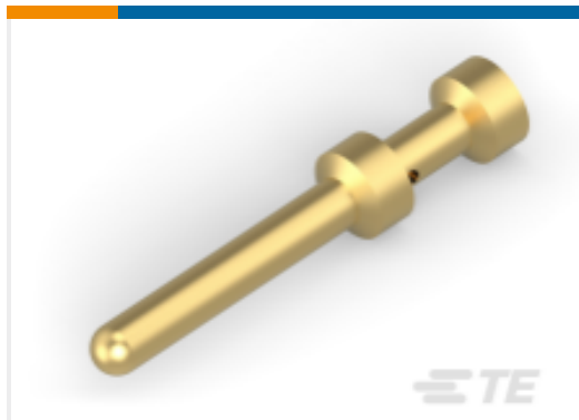
TE Part #T2030011005-000 DEM-0.5