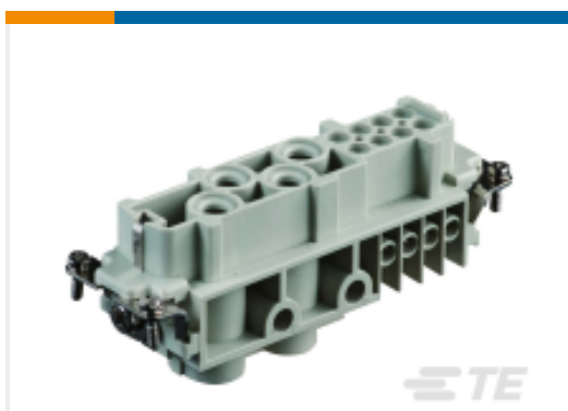
TE Part #T2100122201-000 HK4/8-012-F