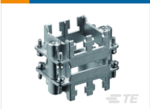
TE Part #T2070244201-000 H24BN-T6-F