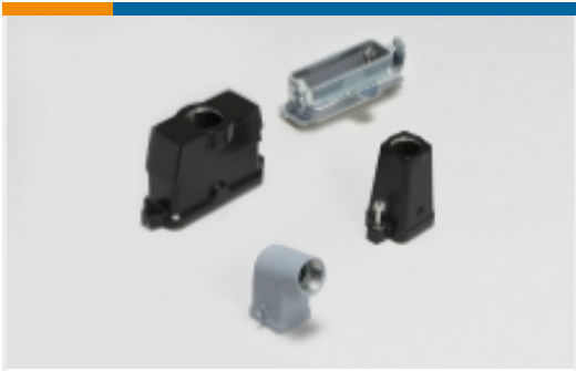
Rectangular Connector Hoods & Bases (1258)