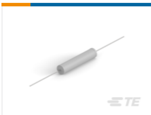
TE Part #2176415-4 8W STD M/OX 5% 39R