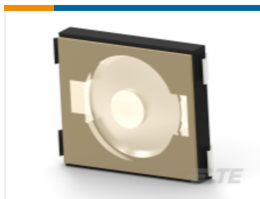
TE Part #2337228-1 TACT ULTRA JB 3.0X2.6X0.65 100GF