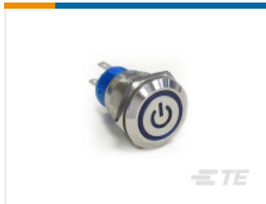
TE Part #6-2213766-9 AV19 DPL 5A POWER LED YELLOW 12V