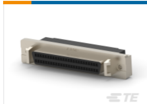
TE Part #749611-9 IDC D-Sub: Receptacle Assembly, Panel Mount, Signal, 1.27 mm