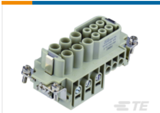
TE Part #T2106062201-000 HWK6/6-012-F