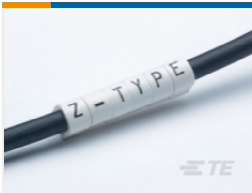
TE Part #EC0366-000 Z-TYPE PUSH-ON MARKERS