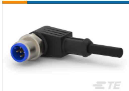
TE Part #2273076-3 M12 A-CODE MALE R/A PIGTAIL