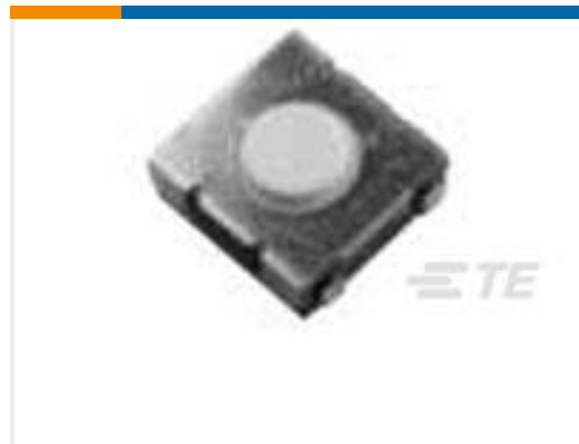
TE Part #1571636-2 TACT,SMT,GULL WING,50GF,T&R