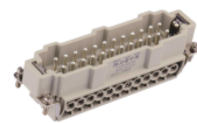
TE Part # T2040242101-000 HE-024-M