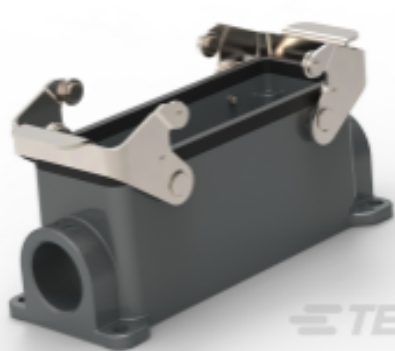
TE Part # T1440241121-000 H24B-SGRS-PG21