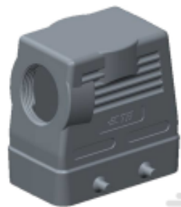
TE Part #T1230160125-000 H16B-TSH-M25