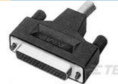
TE Part #5748642-1 KIT,RCPT,62P,HDP-22,SHLD ENCLS