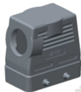
TE Part #T1230160132-000 H16B-TSH-M32