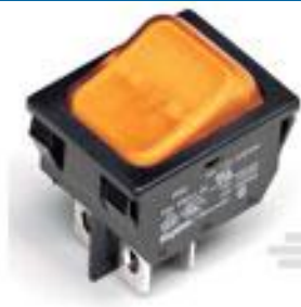
TE Part #1634201-3 PRFDA1-16F-BB0CW