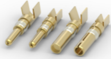
TE Part #213847-3 POWERBAND CONTACTS