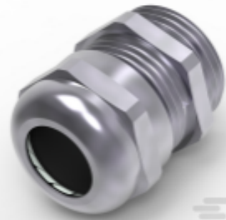
TE Part #T3609250102-000 DLX-25-M