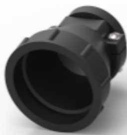
TE Part #182661-1 CPC CABLE CLAMPS EMEA