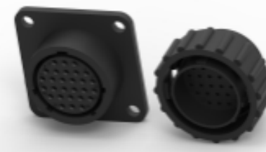
TE Part #206433-3 CPC SERIES 2