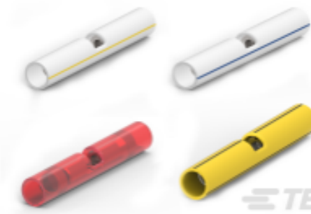
TE Part #320562 PIDG BUTT SPLICES