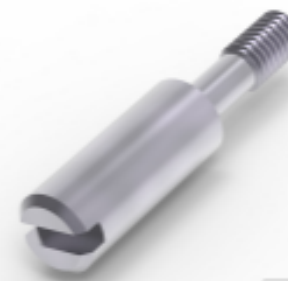
TE Part #T0931003003-000 CODING-PIN-M3