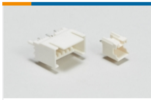
Wire-to-Board Headers & Receptacles (1)