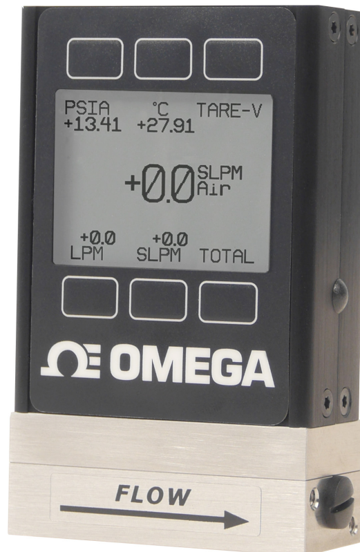
FMA-1603A includes 110 Vac power supply and a 1.8 m (6') cable 8-pin mini DIN connector, Shown smaller than actual size.

The FMA-1600A Series mass and volumetric flow meters use the principle of differential pressure within a laminar flow field to determine the mass flow rate. A laminar flow element (LFE) inside the meter forces the gas into laminar (streamlined) flow. Inside this region, the Poiseuille equation dictates that the volumetric flow rate be linearly related to the pressure drop. A differential pressure sensor is used to measure the pressure drop along a fixed distance of the LFE. This, along with the viscosity of the gas, is used to accurately determine the volumetric flow rate. Separate absolute temperature and pressure sensors are incorporated and correct the volumetric flow rate to a set of standard conditions. This standardized flow rate is commonly called the mass flow rate and is reported in units such as standard cubic feet per minute (SCFM) or standard liters per minute (SLM). Standard units include a 0 to 5V output (4 to 20 mA optional) and RS232 communications. The gas select feature can be adjusted from the front keypad or via RS232 communications. Volumetric flow, mass flow, absolute pressure, and temperature can all be viewed or recorded through the RS232 connection. It is also possible to multi-drop up to 26 units on the same serial connection to a distance of 38 m (125'). These flow meters are available in a portable version (“-B” option), the battery charge will last up to 18 hours.