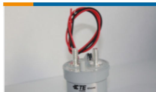
TE Part #1618002-4 EV200A3ANA=RELAY, EV200, SPST- NO