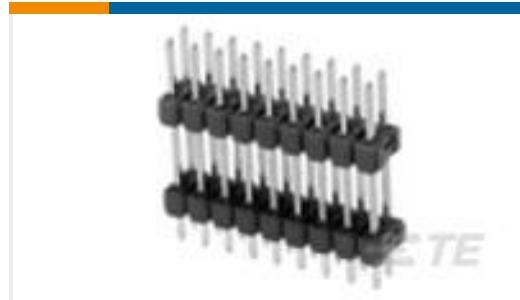
TE Part #146507-2 04 MODII HDR DRST UNSHRD STKG