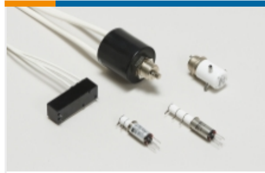
High Voltage Relays(17)