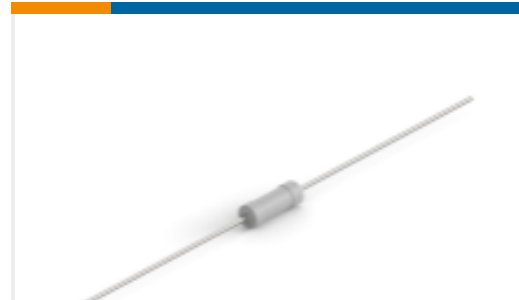
TE Part #1-2176411-6 1/2W SM M/OX 5% 47K