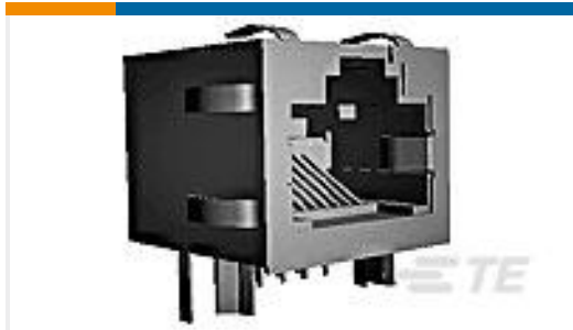
TE Part #1-406541-5 MJ,INV,1X1,0PNL G.,100"ST,SN