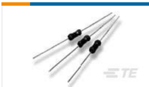
TE Part #1-1879355-0 RR03 5% 10K AMMO