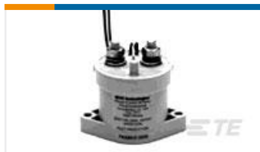
TE Part #1-1618002-1 EV200ADANA=RELAY, EV200 SPST- NO