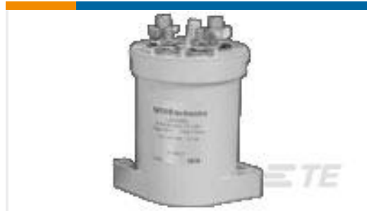
TE Part #1618387-3 LEV200A4ANA=RELAY, SPST-NO