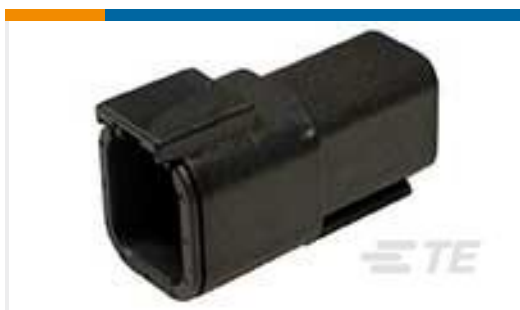
TE Part #DTM04-6P-E004 REC, 6P, BLK, N