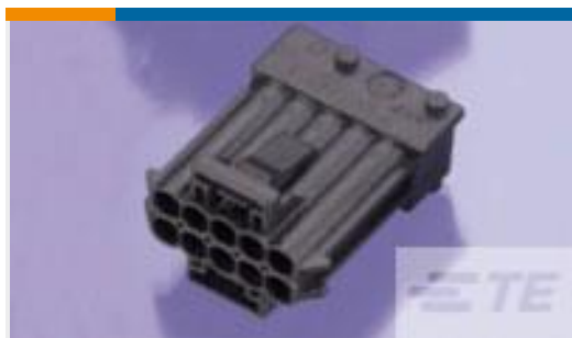
TE Part #1-965423-1 TAB HOUSING2,8 10POS