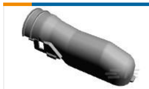
TE Part #1418994-1 AMP MCP 2.8 HSG.WITH SEC.10POS