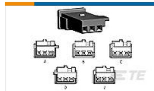
TE Part #1-1718346-1 3POS MQS REC COD A