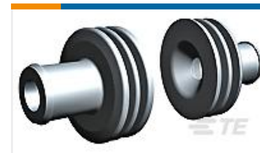
TE Part #1544316-1 JOINT VERT G2