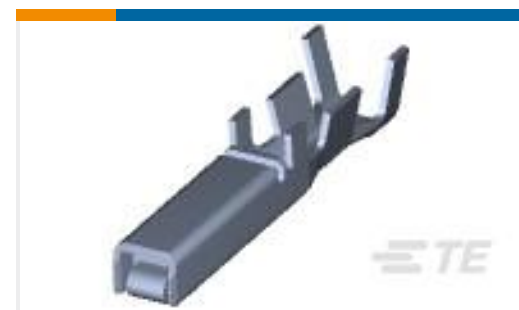
TE Part #1-175196-5 DYNAMIC D-3 REC CONT/L PRE-TIN