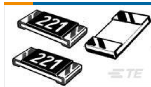
TE Part #1-2176230-3 3522 8R2 5% 3W