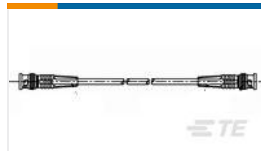
TE Part #1337769-2 50OHM COAX BNC STR PLUG STR P