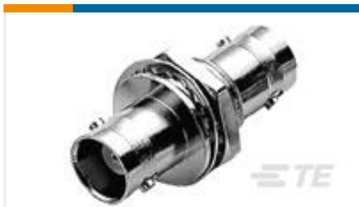
TE Part #1-1478045-0 BNC BH Adp JJ 75Ohm Silver Pltd