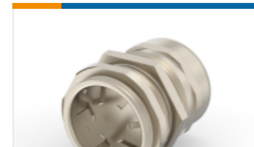
TE Part #1478884-5 METRIC EMC GLAND M32X1.5