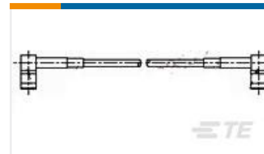
TE Part #1337817-1 50 OHM COAX SMB ELB PLUG ELB P