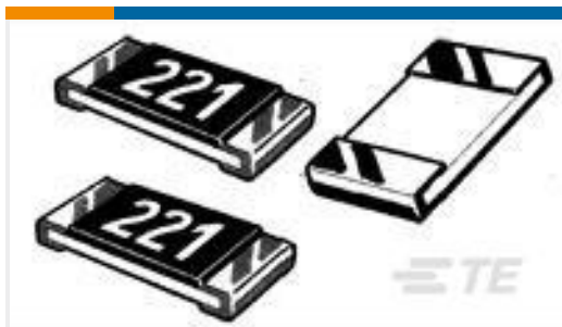
TE Part #1622820-2 3520 100R 5%