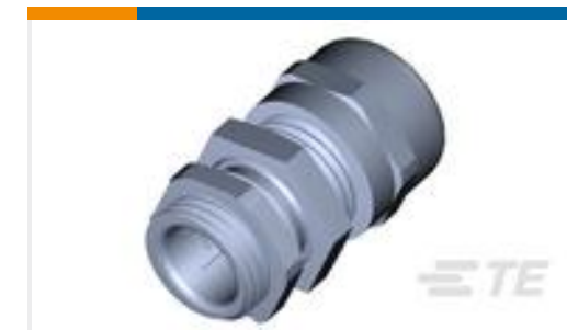
TE Part #1478884-2 Metric EMC Gland M16x1.5