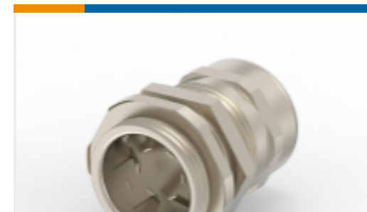
TE Part #1478884-4 METRIC EMC GLAND M25X1.5