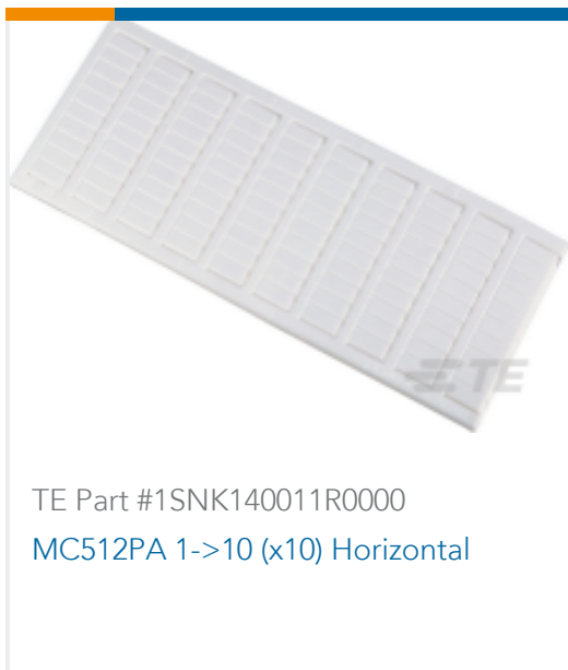
TE Part #1SNK140011R0000 MC512PA 1->10 (x10) Horizontal