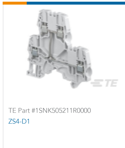
TE Part #1SNK505211R0000 ZS4-D1