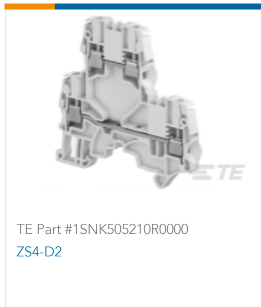
TE Part #1SNK505210R0000 ZS4-D2