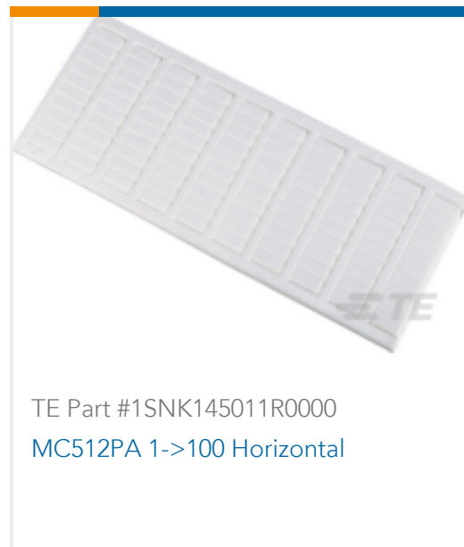
TE Part #1SNK145011R0000 MC512PA 1->100 Horizontal