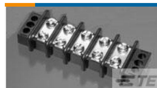
TE Part #1546310-2 2P .563" DR BARRIER STRIP