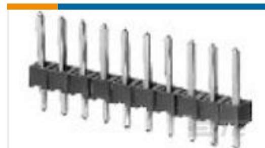
TE Part # 5-146284-2 02 MODII HDR SRST B/A .100CL