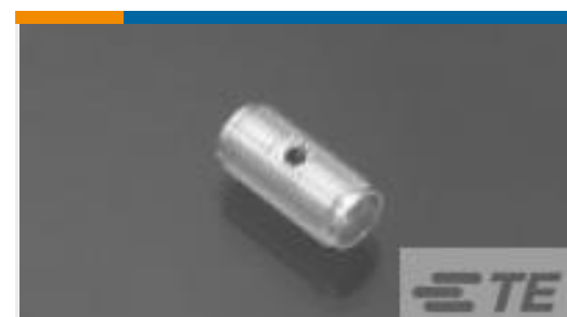
TE Part #1053514-1 2080 5055 02