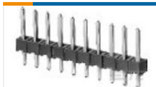
TE Part # 5-146276-2 02 MODII HDR SRST B/A .100CL