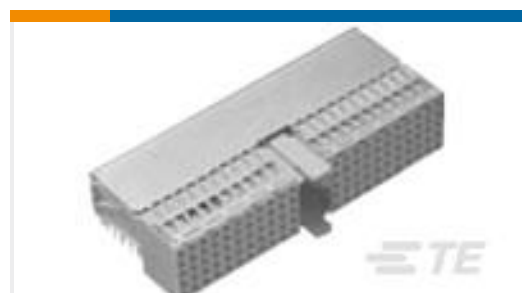
TE Part #100147-1 Z-PACK/A F-HDR.110P