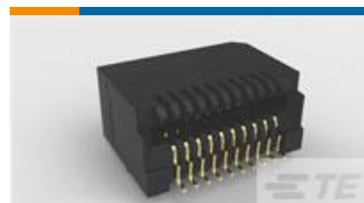
TE Part #1367073-1 20 POS SMT CONN, SFP, 15AU