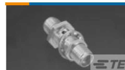
TE Part #1054881-1 2084 1900 02