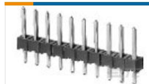
TE Part # 5-146280-2 02 MODII HDR SRST B/A .100CL