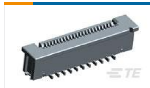
TE Part #1-1734742-4 .5 FPC VT ZIF Type-A 14 CONT