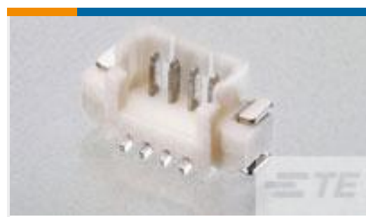
TE Part #1734260-8 1.25 WTB HDR SMT, 8 POS