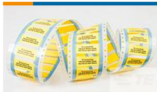
TE Part #9246090001 TMS-SCE-1/8-2.0-S1-9