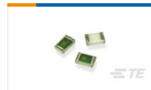
TE Part #1676143-1 RN 0805 100R 0.1% 10PPM CUT LENGTH