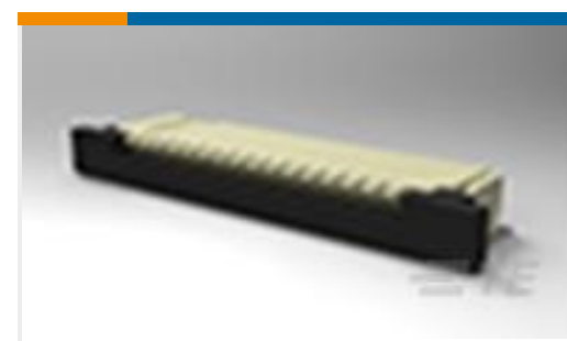
TE Part #1-84953-0 1MM FPC HORZ.TOP CONT.ASSY 10P