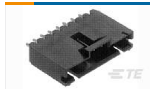
TE Part #103670-3 04 MTE HDR SRST LATCH W/HLDWN