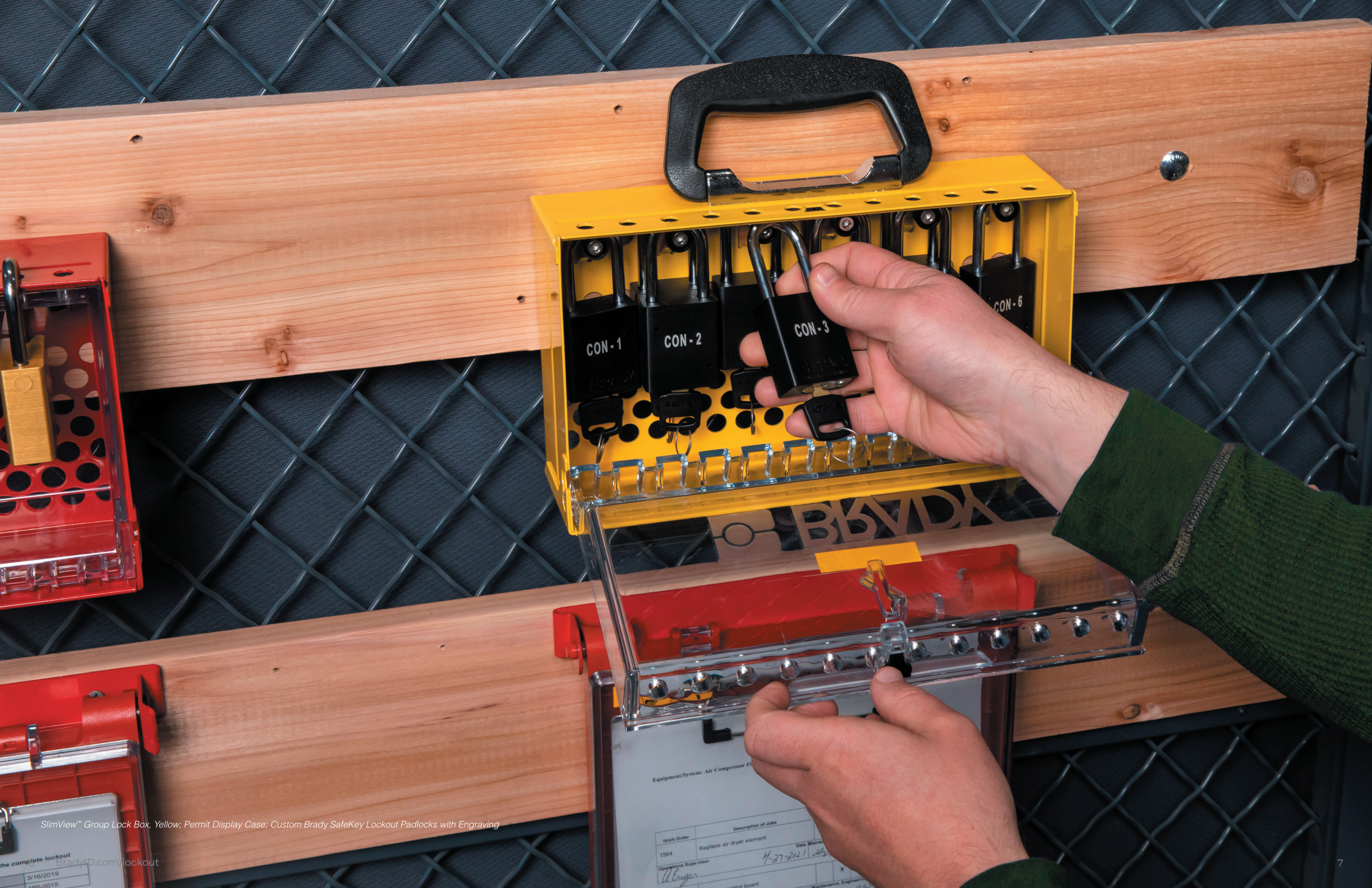
SlimView™ Group Lock Box, Yellow; Permit Display Case; Custom Brady SafeKey Lockout Padlocks with Engraving

the complete lockout BradyD.com/lockout 3/16/2019 160-0019