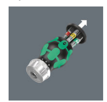
The handle can be opened and thus gives access to the six bits contained in the magazine.