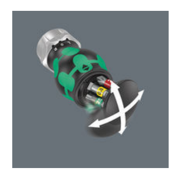
The swiveling bit magazine allows for the bits to be removed easily in almost any situation and cannot be lost. The bits are safely stored.