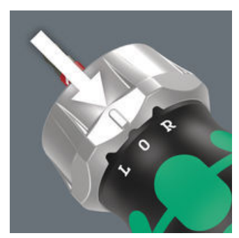
The ratchet mechanism is fine-toothed for a low return angle. The screwdriving directions right/fixed/left can be set with the reversible ring. The magnetic bit mounting is suitable for bits with 1/4" external hexagon drive as per DIN ISO 1173-C 6.3 and Wera connection series 1