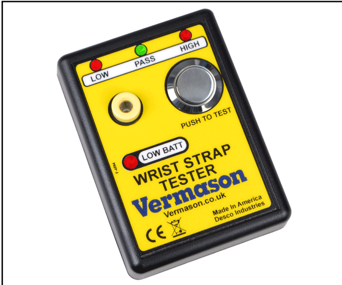
Figure 1. Vermason 225221 Portable Wrist Strap Tester