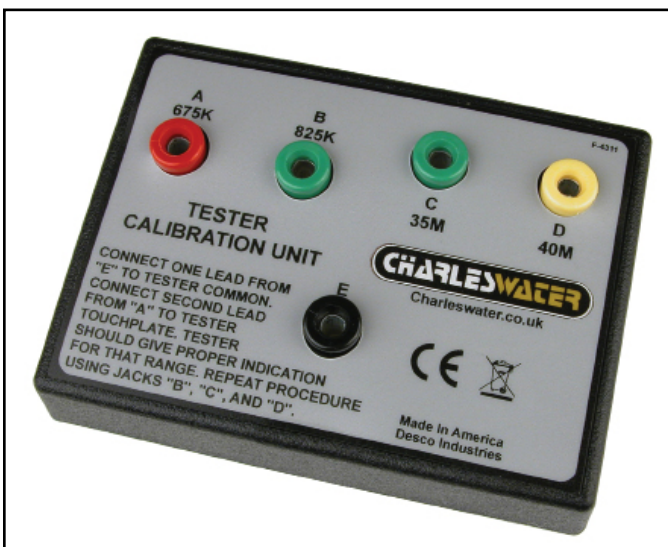
Figure 3. Charleswater 99090 Calibration Unit

View technical bulletin PPE-5034.E for more information on the Charleswater 99090 Calibration Unit and instructions to calibrate the Portable Wrist Strap Tester.