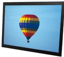
19" Rack Mount option

15.6" TFT LCD Full HD Colour Wide Screen Monitor 1920 x 1080P with LED Back Light, inputs of HDMI, DVI, VGA, 2 x Composite video In/Out BNC, Y/C (S-Video) in. Audio In/Out and via Speakers, I/R Remote Control. Options: 19" Rack Mount, Touch screen, Glass front. Other sizes available.