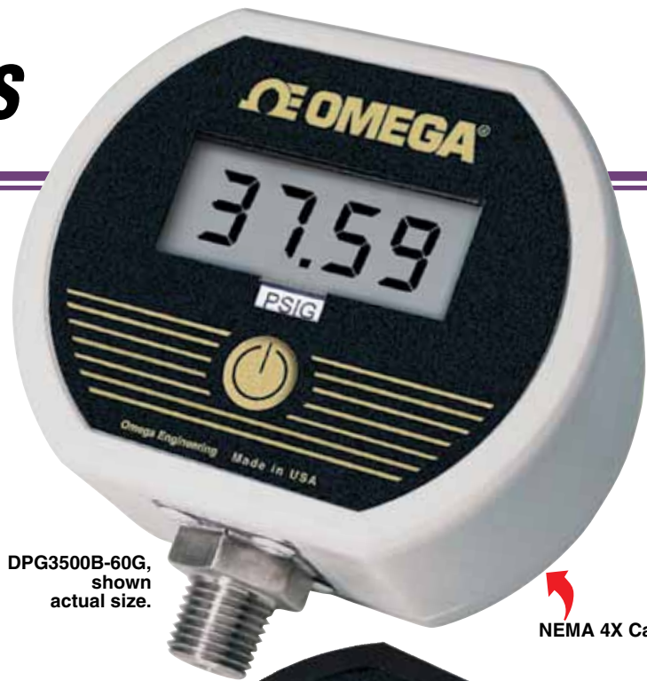
DPG3500B-60G, shown actual size.

Calibration: Internal controls, non-interactive zero, span and linearity ±10% range