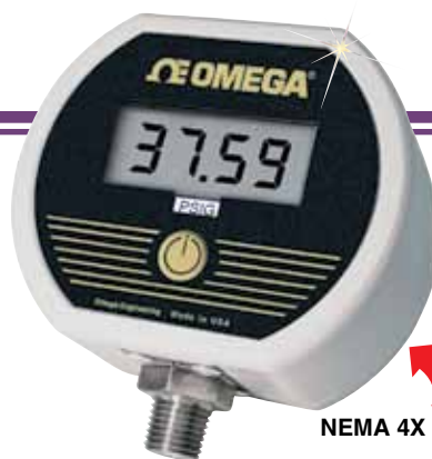
NEMA 4X Case

Specify model DPG3600B for backlit display