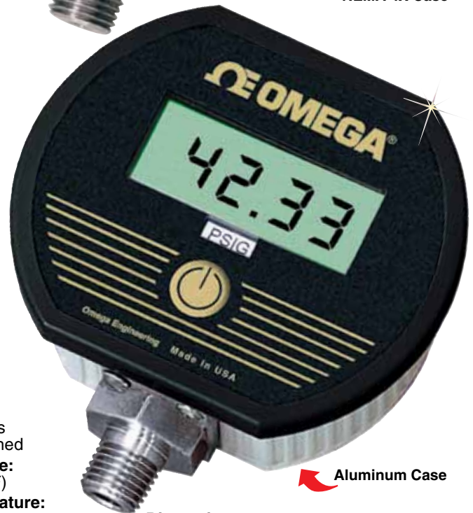
DPG5500B-60G shown actual size.