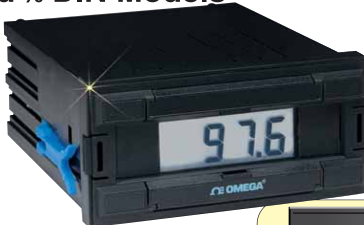
DP35 1/8 DIN loop-powered LCD meter, $160, shown smaller than actual size.