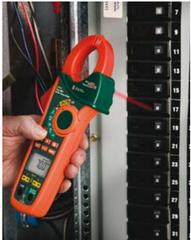
Built-in infrared thermometer for quick and safe non-contact temperature measurements. Find hot spots fast!