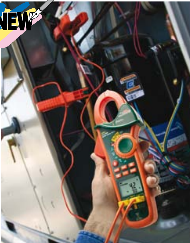
Dual Type K inputs for taking differential temperature readings needed for superheat measurements.