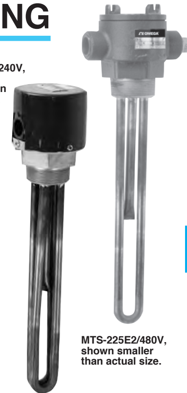
MTS-225E2/480V, shown smaller than actual size.

MTS-240A/240V, shown smaller than actual size.