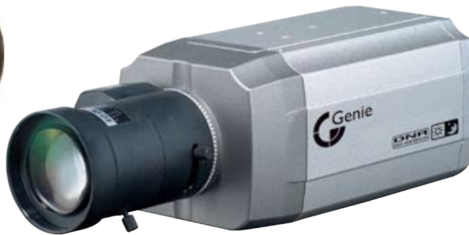
C5352 / DNR5352