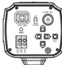
C5352 / DNR5352