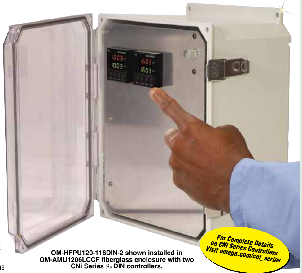
OM-HFPU120-116DIN-2 shown installed in OM-AMU1206LCCF fiberglass enclosure with two CNI Series \frac{1}{8} DIN controllers.

OM-AMU series non-metallic fiberglass enclosures are designed to insulate and protect electrical controls and components in both indoors and outdoors applications and are especially well suited for higher temperatures and corrosive environments. These NEMA 4X (IP66) fiberglass JIC junction boxes feature clear polycarbonate covers with a variety of screw or latching options.