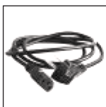
EU+UK/US depending on region