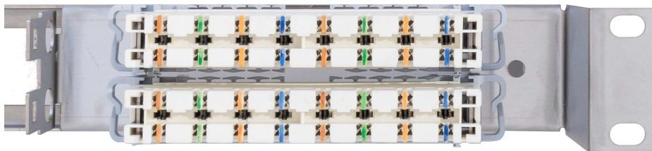
Example of sub-rack mounting