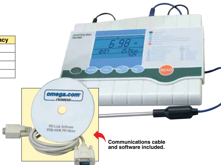
Communications cable and software included.