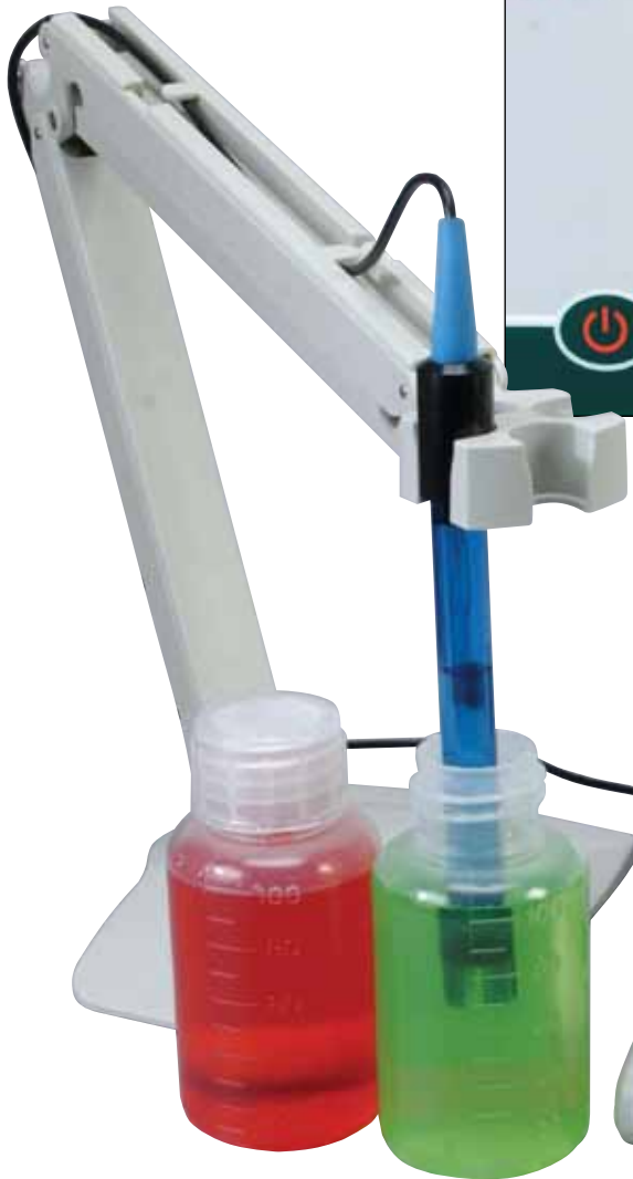
PHB-600R, with pH electrode, temperature probe, 2 buffer solutions and electrode holder (all included), shown smaller than actual size.

The PHB-600R features a front panel with user-friendly keys with descriptive icons.