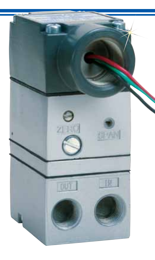
IP610-X60 with conduit electrical termination shown actual size.

RFI/EMI Effect: 0.5% of span change in output pressure per En 61000-4-3:1998, Amendment 1, Performance Criterion A