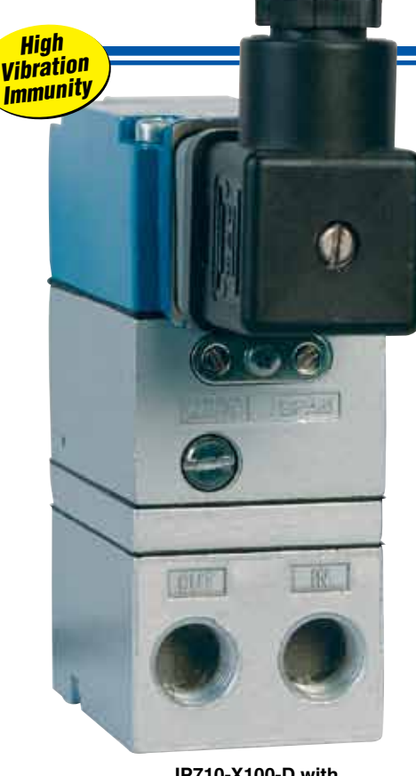
IP710-X100-D with DIN electrical termination shown actual size.

The IP610 and IP710 are electronic pressure regulators, converting a 4 to 20 mA signal to a proportional pneumatic output. Both units feature a compact housing, accessible ports and easy adjustments, making them ideal for space-constrained applications. They also feature high tolerance for impure air and an integral volume booster, providing high flow capacity, increasing control speed in critical applications.