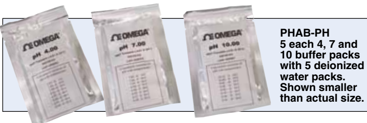
PHAB-PH 5 each 4, 7 and 10 buffer packs with 5 deionized water packs. Shown smaller than actual size.

Formulated to provide precise pH determinations, these buffer solutions which are standardized against NIST-certified reference samples, are ideal for calibrating electrodes and pH meters. The buffers are color-coded to avoid error and accurate to within \pm 0.01 pH at 25°C (77°F). Each buffer contains a preservative/mold inhibitor and a shrink-sealed cap to prevent contamination and leakage. Temperature compensation charts are included with each buffer solution.