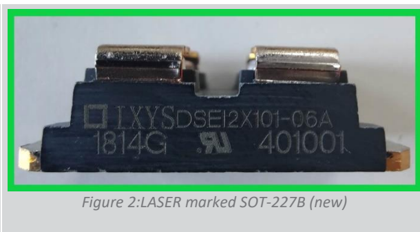
Figure 2: LASER marked SOT-227B (new)

A description of the marking is given in Figure 3