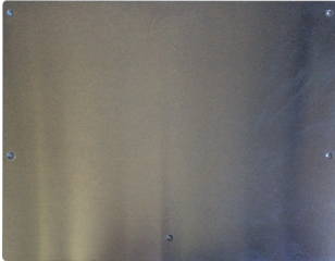
Adaptor Board for GLB Enclosure