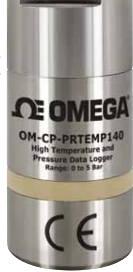
OM-CP-PRTEMP140-NPT 1/8 NPT pressure port.

All models shown larger than actual size.