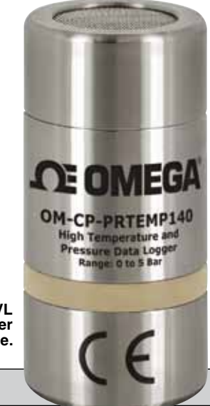
OM-CP-PRTEMP140-LVL (flush top) shown larger than actual size.