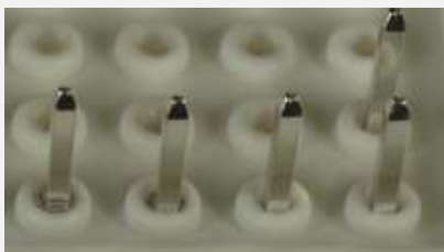
(Easy package module)