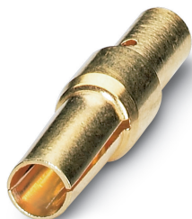
Crimp contact, turned, contact diameter: 2 mm, crimp range: 0.5 mm 2 ... 0.75 mm 2

Please be informed that the data shown in this PDF Document is generated from our Online Catalog. Please find the complete data in the user's documentation. Our General Terms of Use for Downloads are valid ( http://phoenixcontact.com/download )