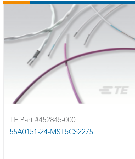
TE Part #452845-000 55A0151-24-MST5CS2275