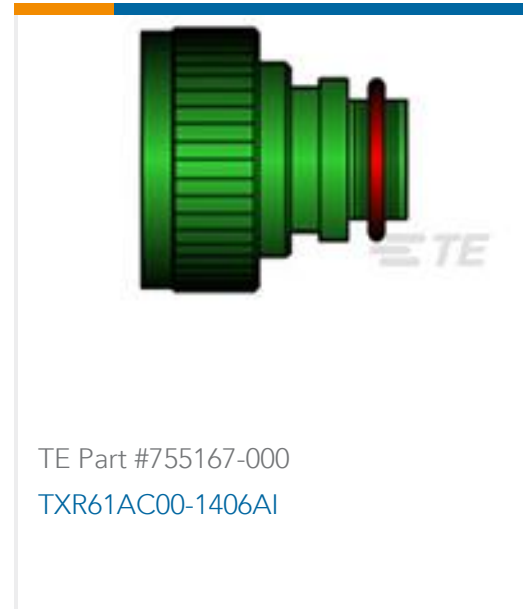
TE Part #755167-000 TXR61AC00-1406AI