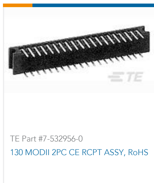
TE Part #7-532956-0 130 MODII 2PC CE RCPT ASSY, RoHS