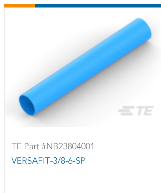
TE Part #NB23804001 VERSAFIT-3/8-6-SP