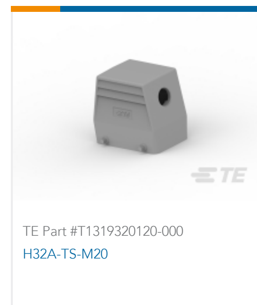
TE Part #T1319320120-000 H32A-TS-M20