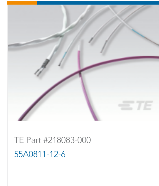
TE Part #218083-000 55A0811-12-6