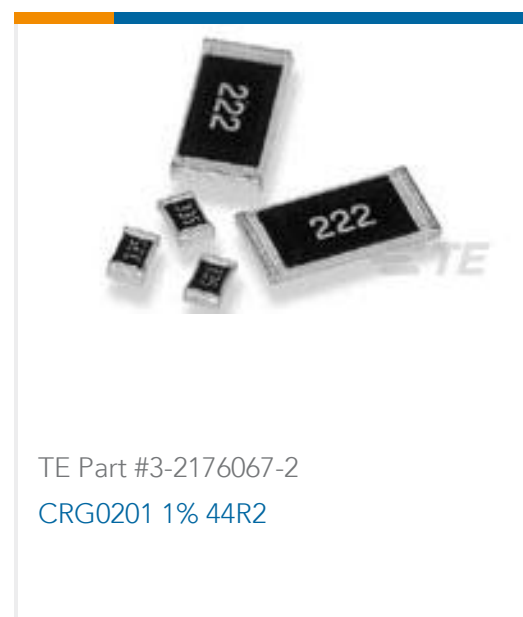
TE Part #3-2176067-2 CRG0201 1% 44R2