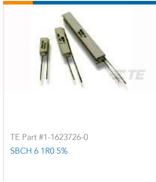
TE Part #1-1623726-0 SBCH 6 1R0 5%