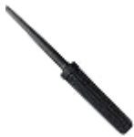
Probe Adjust Tool