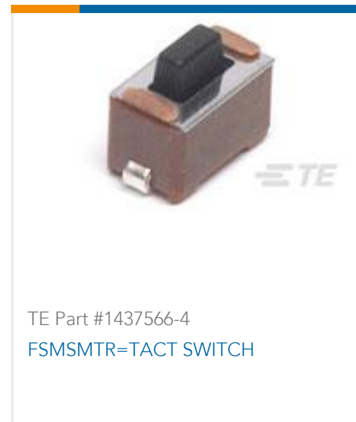
TE Part #1437566-4 FSMSMTR=TACT SWITCH