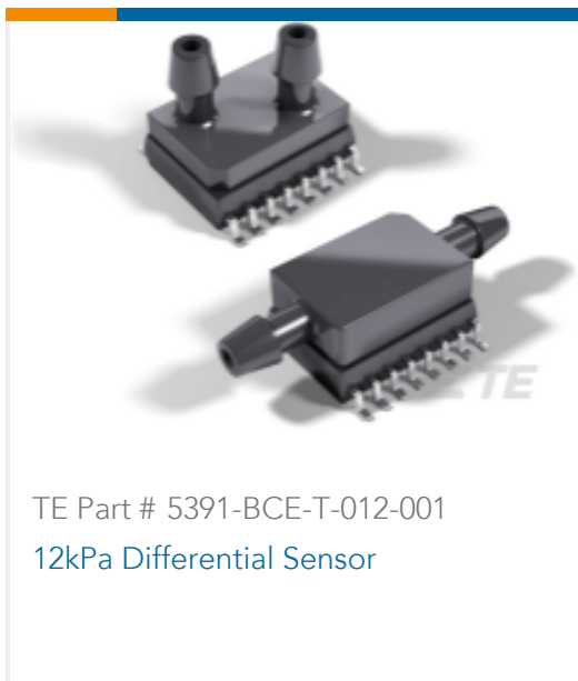
TE Part # 5391-BCE-T-012-001 12kPa Differential Sensor