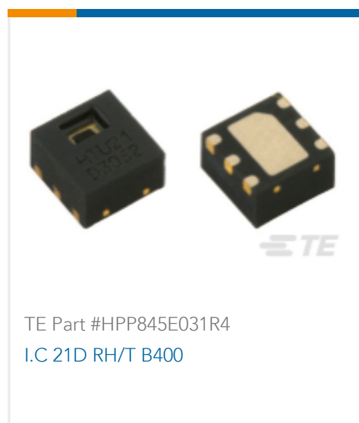
TE Part #HPP845E031R4 I.C 21D RH/T B400