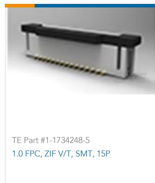
TE Part #1-1734248-5 1.0 FPC, ZIF V/T, SMT, 15P