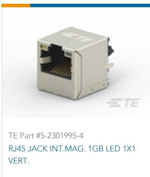
TE Part #5-2301995-4 RJ45 JACK INT.MAG. 1GB LED 1X1 VERT.