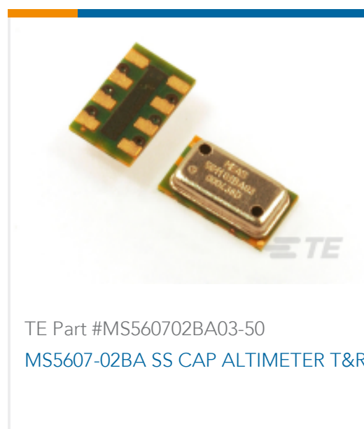
TE Part #MS560702BA03-50 MS5607-02BA SS CAP ALTIMETER T&R