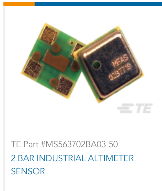
TE Part #MS563702BA03-50 2 BAR INDUSTRIAL ALTIMETER SENSOR