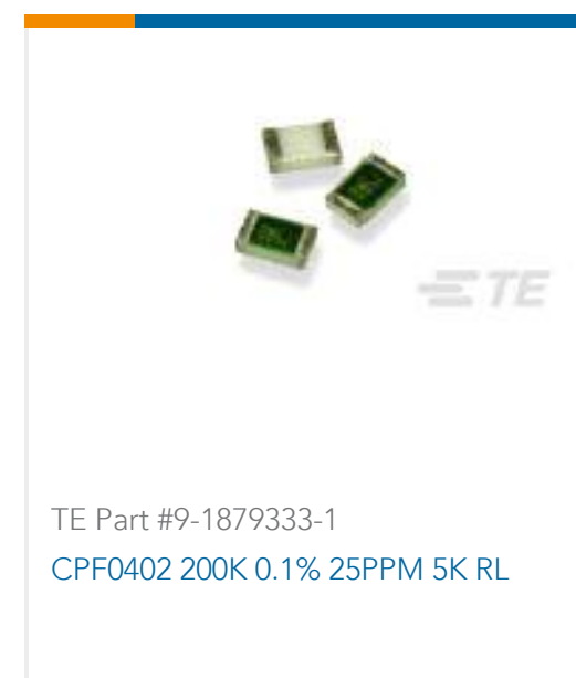
TE Part #9-1879333-1 CPF0402 200K 0.1% 25PPM 5K RL