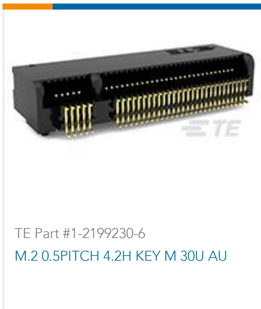
TE Part #1-2199230-6 M.2 0.5PITCH 4.2H KEY M 30U AU