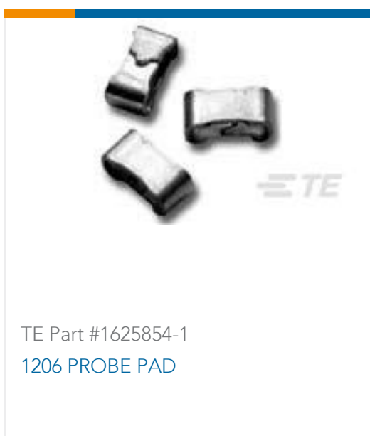
TE Part #1625854-1 1206 PROBE PAD