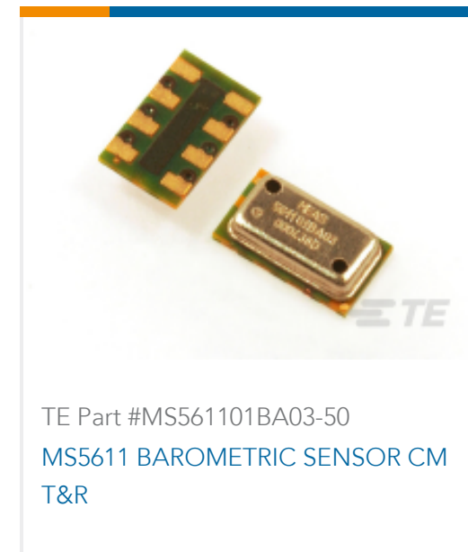
TE Part #MS561101BA03-50 MS5611 BAROMETRIC SENSOR CM T&R