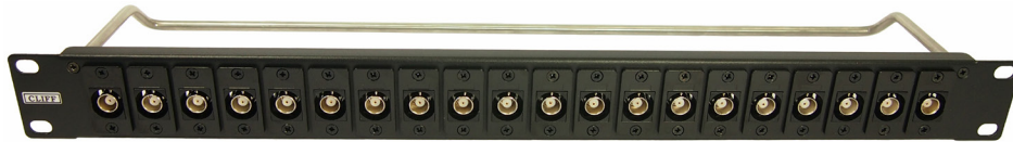
1U Panel Loaded with 20 Narrow BNC Feedthrough Connectors