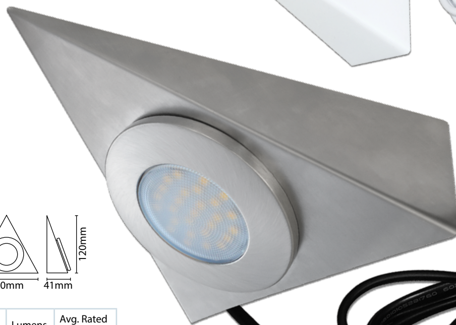
Pre-wired with 2m cable