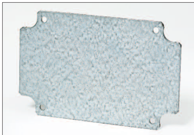
Metal Mounting Plate.

Metal mounting plates with cut outs for ease of installation