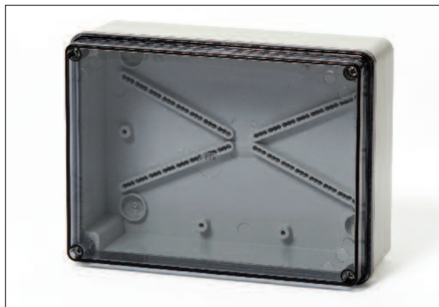
Junction Box Transparent Lid.