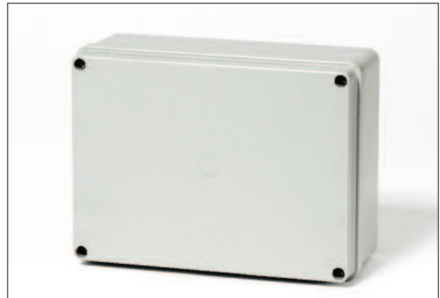
Junction Box Opaque lid.