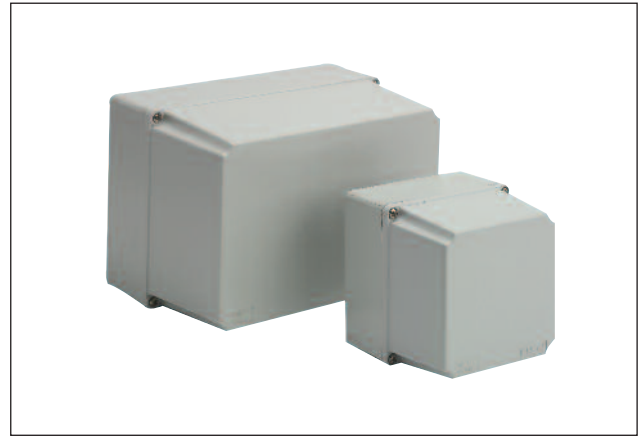
Junction Box with Opaque lid.