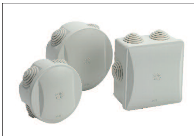
Junction Box with Stepped Glands.