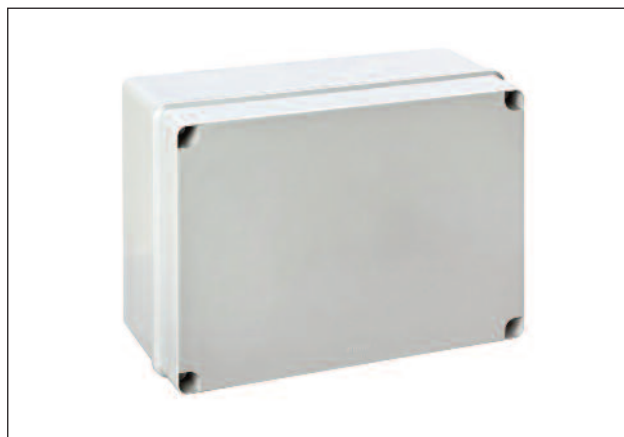
Junction Box with Opaque lid.