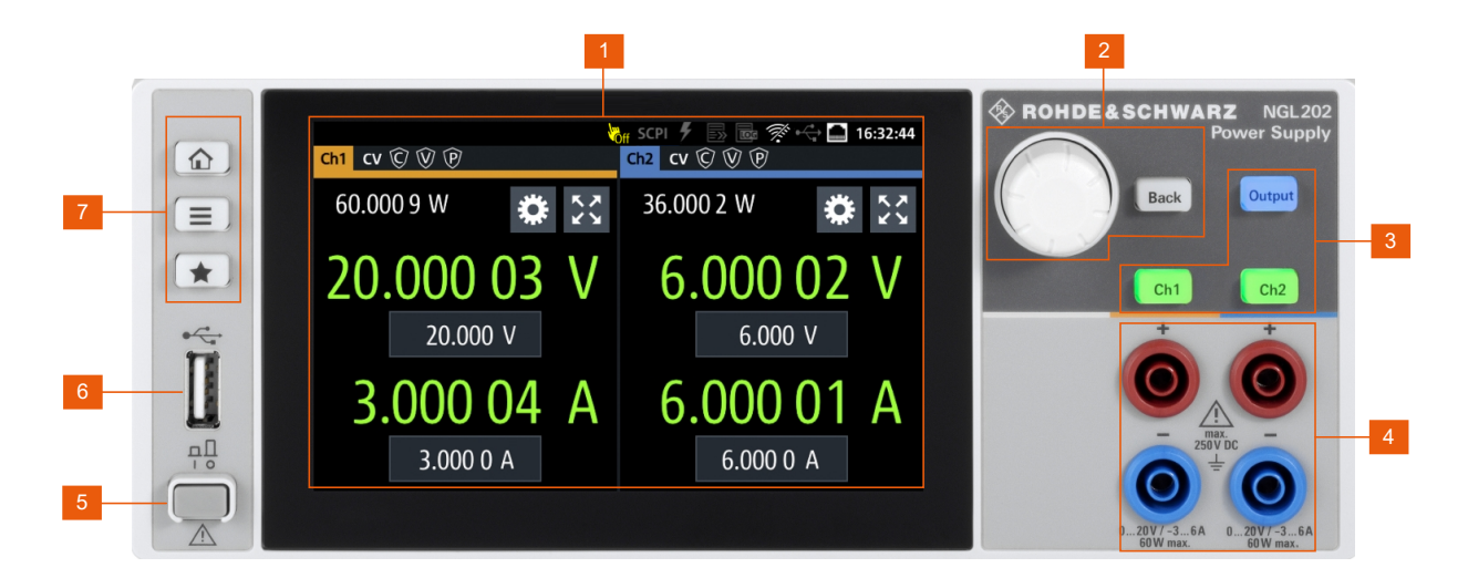
Figure 6-1: Front panel of R&S NGL/NGM with 2 channels

The R&S NGL/NGM has one output channel for R&S NGL201, R&S NGM201 models and two output channels for R&S NGL202, R&S NGM202 models.