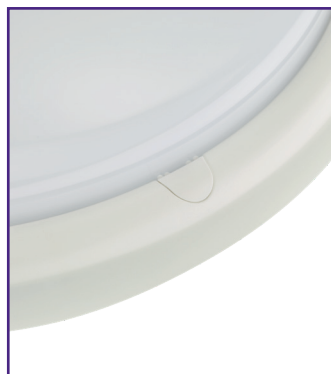
UV-resistant for outdoor use