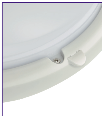
Supplied with tamper-proof screws