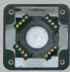
K56506WHI (COVER OFF)