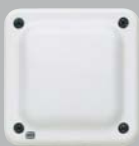
K56506WHI (COVER ON)