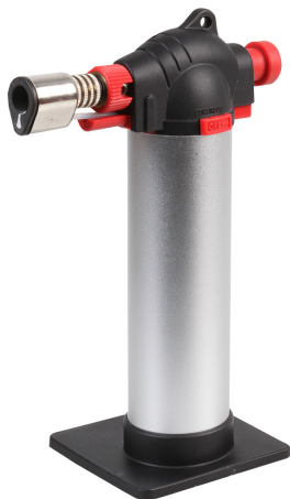
Butane Gas Torch - Adjustable Model: D03356