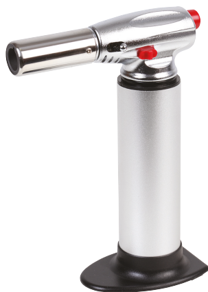
Hand Held Butane Gas Torch Model: D03362