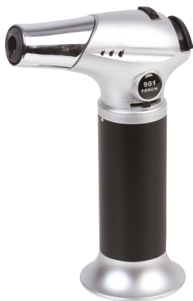
Hand Held Butane Gas Torch Model: D03363